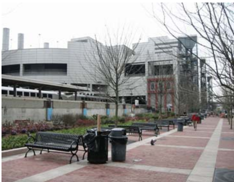
South Station Bus Terminal

South Station today is a clean, busy, vibrant intermodal intersection. It plays a crucial role in supporting the MBTA's very successful commuter rail and in supporting intercity rail, including the new and successful Acela high speed train. The partially completed bus station is a huge improvement over what previously existed in Boston and a much more pleasant experience than most bus stations.