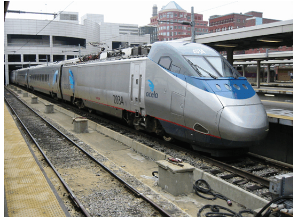
The cement stumps between the tracks are some of the foundations for the future air-rights developments.

Foundations for air rights development were placed during track renovation in the 1980s, but designed to support a slightly different payout than the Hines Development Corporation wanted. Negotiations have led to a compromise that uses current foundations and makes minimal modifications without interrupting train service, while meeting Hines' needs for a significantly larger (up to 40 stories, as opposed to originally 12-14 stories) building (Salvucci).