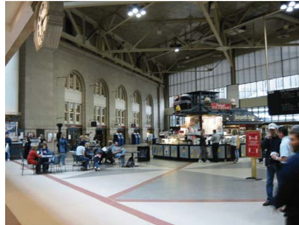
Inside South Station today

The developer and operator of office space and concession space in South Station would have an initial investment in renovation, and continuing operating expenses. They also might have future further renovation costs. Their income would come from leases of space, which is then split with the MBTA.