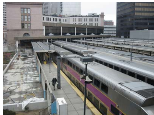
An empty space above the tracks where the bus terminal should be, and space for the walkway.

As construction got underway, several issues affected the construction and renovation. First of all, negotiations with Amtrak and the Tufts Development Corporation delayed the construction of the bus terminal, which did not open until 1993 - five years behind schedule. The location of the bus terminal over the tracks required either that vast ventilation shafts be installed or that Amtrak and the MBTA not use diesel engines in the enclosed space. Amtrak refused to convert its engines to electric power as they entered the station, nor would they change their schedules to allow the trains to back into the station. As a result, the bus station that eventually was constructed was only half built. The space adjacent to the headhouse was left open for ventilation.