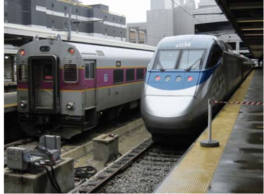
Amtrak's Acela and the MBTA Commuter Rail co-exist at South Station

When compared to the plans laid in the 1970s, the progress made on South Station seems inadequate. The current bus terminal is only half of what was planned and was still completed ten years behind schedule. The air rights development, including parking and valuable downtown space, is currently almost twenty years behind schedule. Intercity rail, a significant portion of South Station's business, has fallen behind predictions in the more than twenty years since South Station's renovation began. But despite these negative facts, the renovation of South Station has actually been a major success.